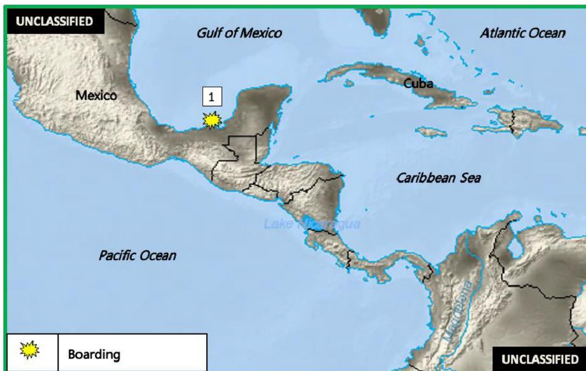
Figure 1. North America Piracy and Maritime Crime

1. MEXICO: On the evening of 14 April at 2230LT, approximately six robbers boarded the anchored Gibraltar-flagged offshore accommodation barge TELFORD 28 approximately 12 NM north of Ciudad Del Carmen at 18:51N - 091:52W. The robbers, armed with automatic weapons and pistols, attempted to enter the accommodation area and then opened fire