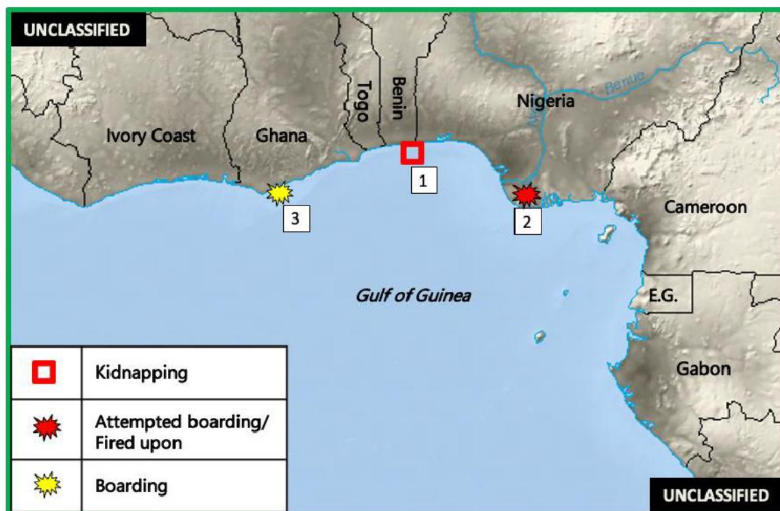
Figure 2. Gulf of Guinea Piracy and Maritime Crime

1. (U) BENIN: On 19 April, armed men in a speedboat approached and boarded the Portugal-flagged container ship TOMMI RITSCHER in Cotonou Anchorage at 06:16N - 002:32E. Eleven of the 19 crewmembers managed to secure themselves in the citadel; the armed men kidnapped the other eight crew members. On 20 April, Nigerian Special Forces conducted an unopposed boarding and freed the 11 crew members in the citadel. Reports indicate the TOMMI RITSCHER had Russian, Ukrainian, Bulgarian, and Filipino crew members. (MDAT-GOG, Clearwater Dynamics, IMB, Dryad Global)